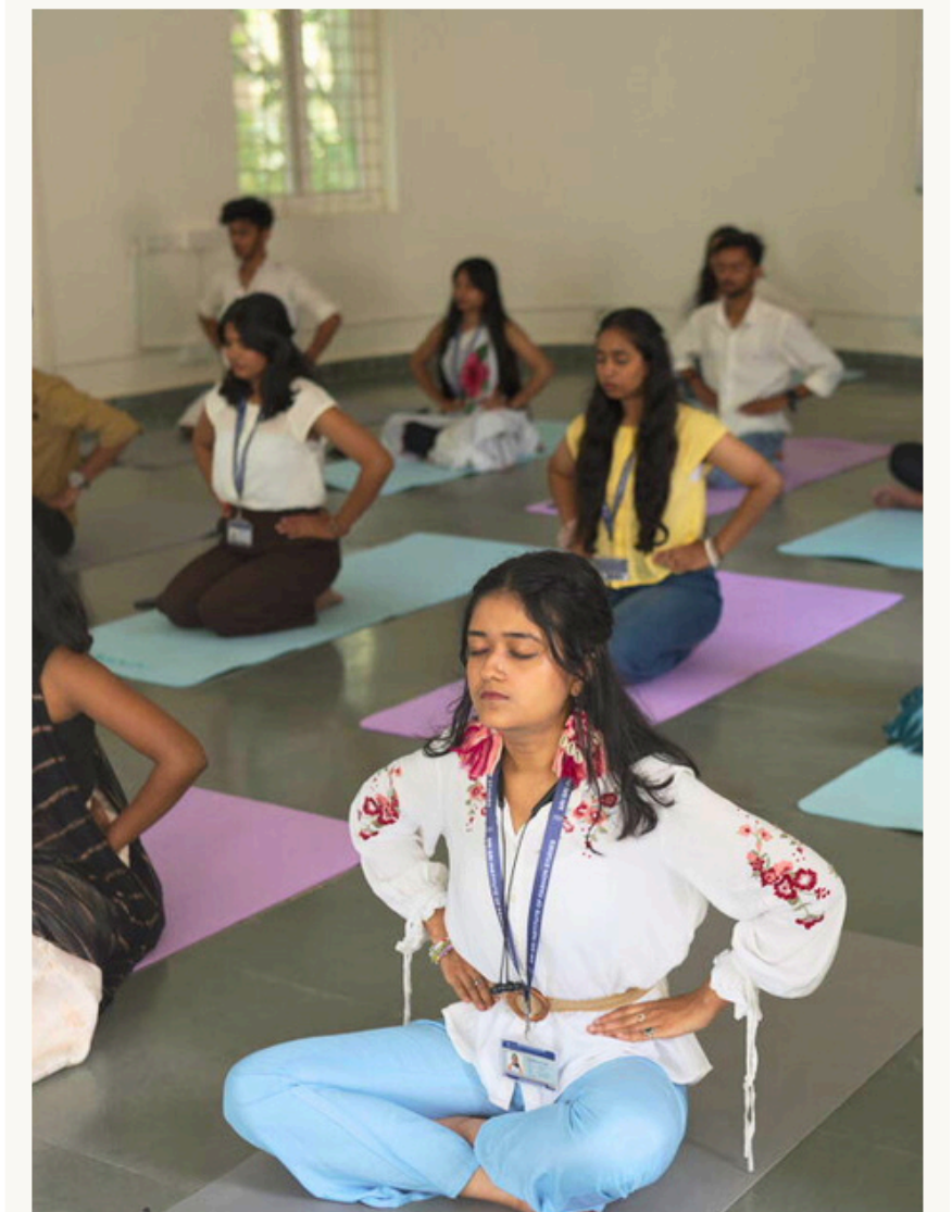
Yoga & Meditation Room